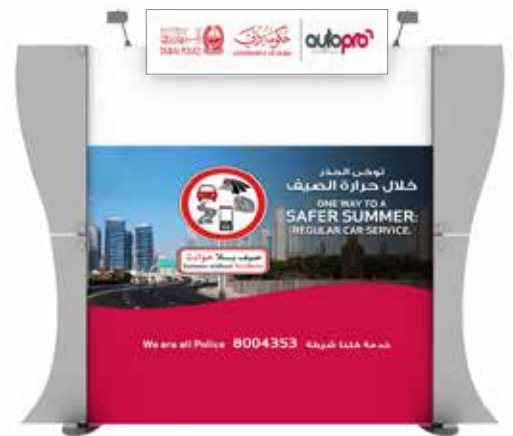
Backdrop with Header & wings