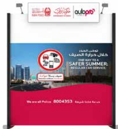
Backdrop with Header