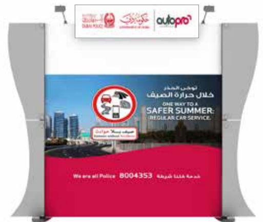
Backdrop with Header & wings